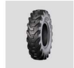
KNK - 72 Em - Industrial Tyre