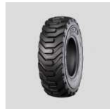
IND - 85 Em - Industrial Tyre