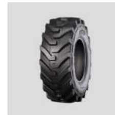
IND - 88 Em - Industrial Tyre