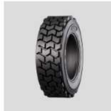
KNK - 65 Em - Industrial Tyre