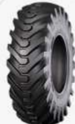
IND 80/SH R4 IND