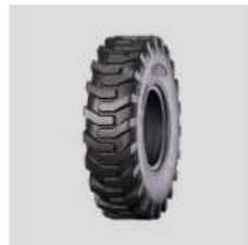
KNK - 74 Em - Industrial Tyre