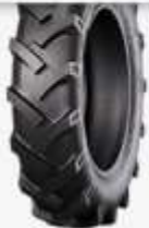
KNK 50 / SH 39