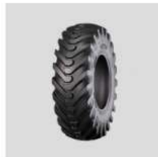
IND - 80 Em - Industrial Tyre