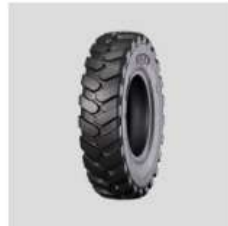
KNK - 44 Em - Industrial Tyre