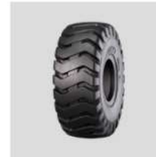
KNK - 70 Em - Industrial Tyre